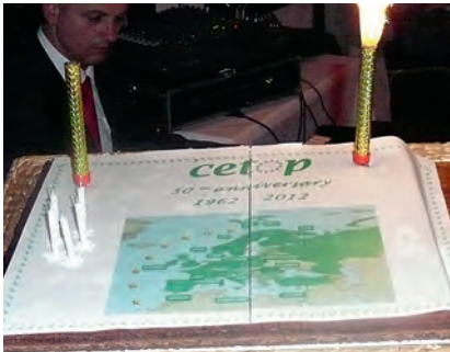
Paris 2012 · 50th anniversary of CETOP