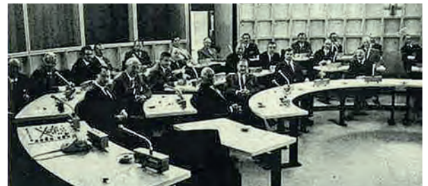
Conference of the CETOP Technical Commission Oil Hydraulics, Düsseldorf 1965