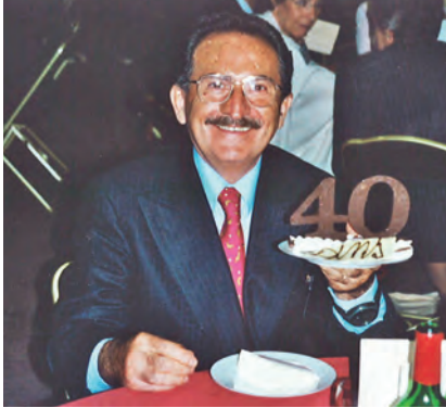
Brussels 2002 · 40th anniversary of CETOP