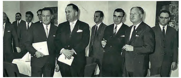
Welcome for CETOP at Hanover Fair 1965