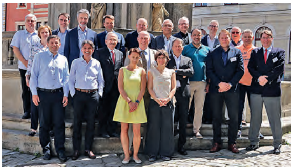
Cesky Krumlov 2019